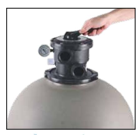
Vari-Flo™ 7-Position Control Valve

with easy-to-use lever-action handle lets you "dial" any of seven valve/filter functions.